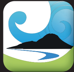
The Eastern Bay App